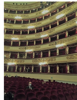
La Scala Interior