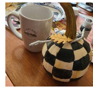
pumpkin in progress Donna's finished pumpkin to paint bottom, turn upside down on cup

Can you create an adorable decorative pumpkin? We offer 2 ways to enter our contest that will take place at our meeting on October 14 th :